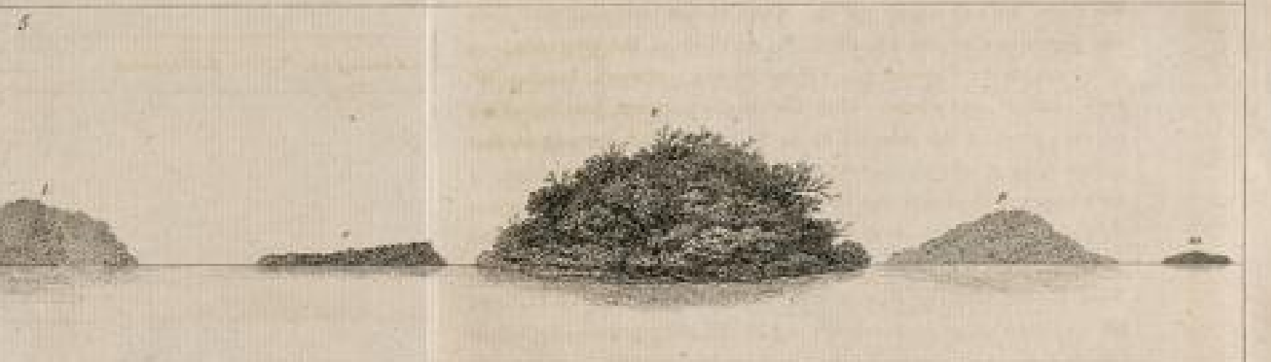
t. Lilita W.S.W. t. Lita t. Tapida t. Pulo Pising S.E.S. or. Mousa S.