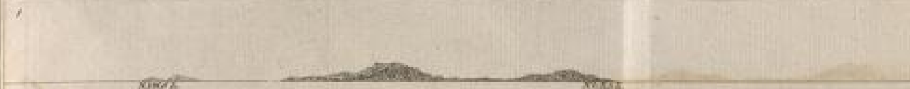
Islands South of Pulo Banner called Geringe