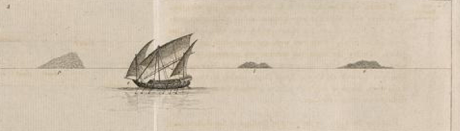
p. Pulo Pising S.E. t. Tarta Galley t. Lilita S.W.S. 1 E. t. Tapida S.E.S. 1 E.