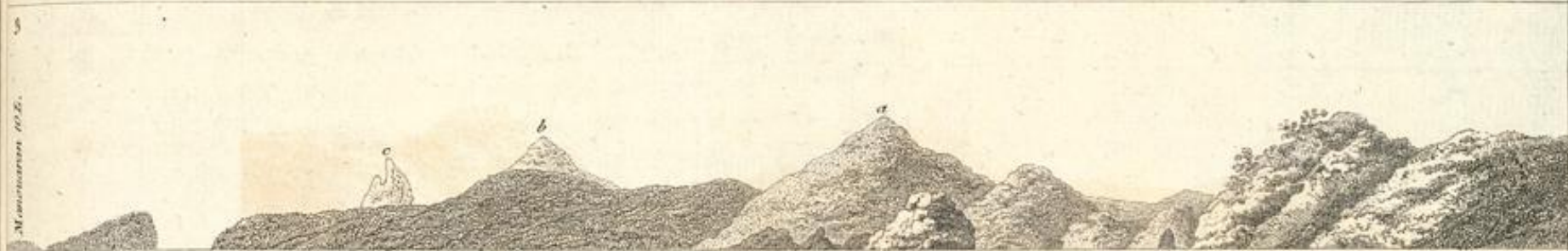
Shoe E. & N. 5 L. a. 1 st Peak b. 2 d Peak c. 3 d Peak or Buffalo's Horn Entrance of Papis Harbour, on Waygiou I. S. Sipsya Rock. II. Rock like a Haycock keep close to it.