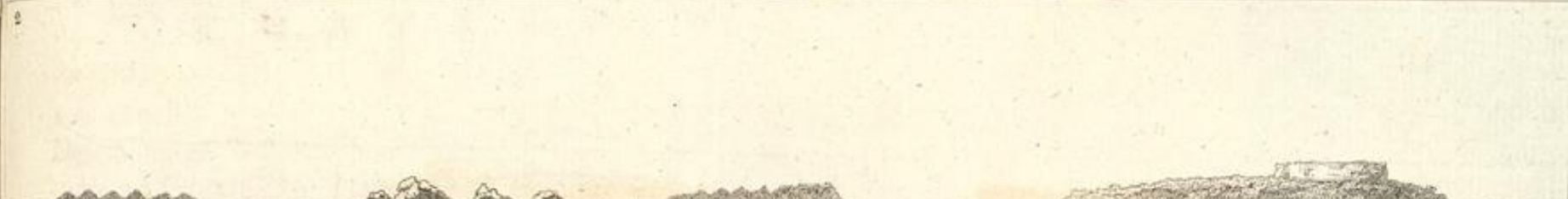
Wyag W.N.W. Seen from the mouth of Papis Harbour Pulo Een N.N.W.