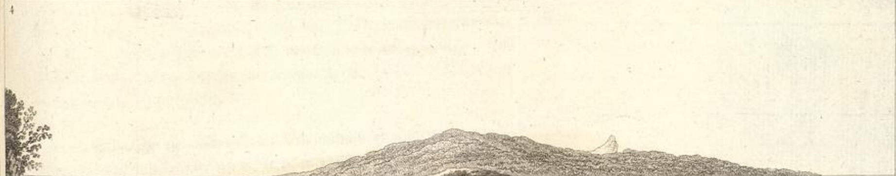
Skirt of Aioubaba I' Manouaran 8 L.S.W. & S. and Waygiou behind