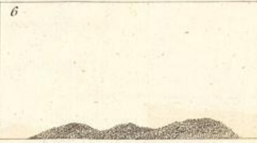
Aioubaba N.E. 5 L.