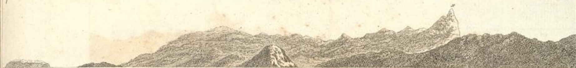
Manouaran E.A.S.5 L. Ravak Entrance (S.E. & S.) of Offak Harbour e. Buffalo's Horn