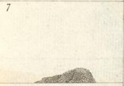
Abdon N.W. 4 L.