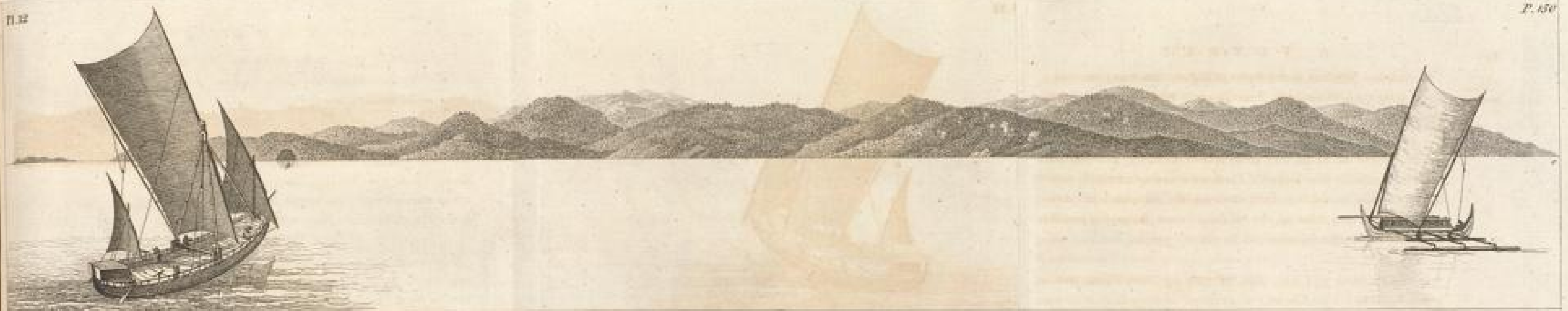
View on the Coast of New - Guinea Part of Dory B.S.E.W.E. Turur Galley b. Bochiu S.E. & S. c. Cape of Good Hope W.S. & S. to E. Corcora