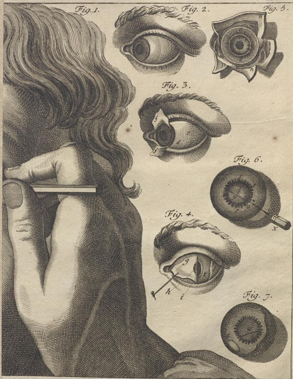
SUFFUSION. NATUR. ET CURAT. pag. 148.