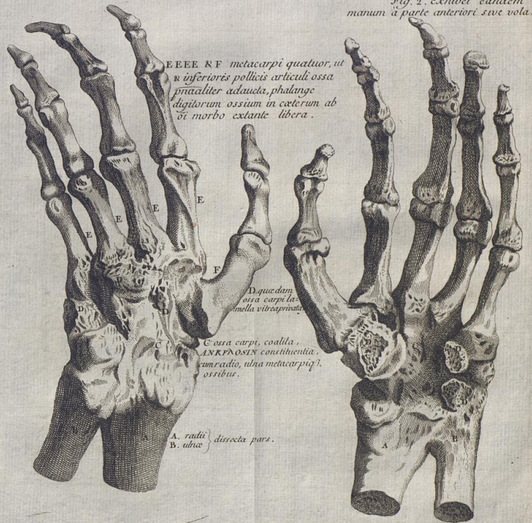
Fig. 2. exhibet eandem manum à parte anteriori sive vola.

EEEE & F metacarpi quatuor, ut & inferiores pollicis articuli ossa p̄ncipaliter adhaerēta, phalange digitorum ossium in ceterum ab si morbo extante libera.