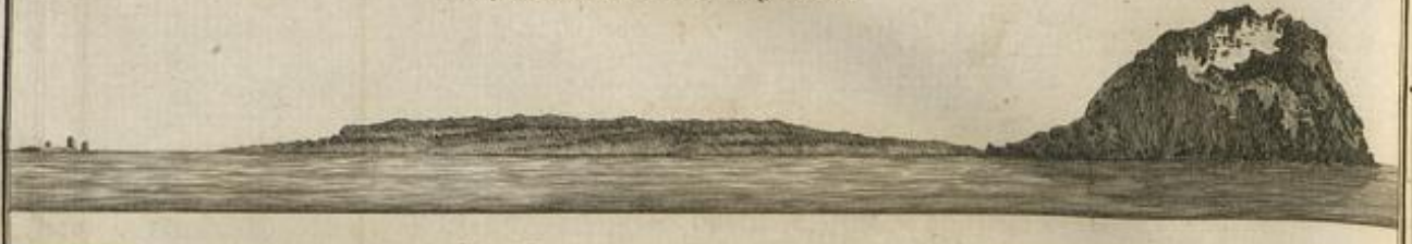
Hill on the S t Part

SULPHUR Island ( Lat. 21^{\circ} 46' N. Long. 149^{\circ} 15' E. Var. 1^{\circ} 20' E.